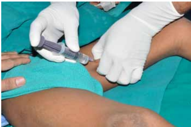
Fig. 2a. The adductor longus is palpated and alcohol is injected into the muscle belly.

Under sterile conditions 0.5 to 0.75ml (in older children) of 40% ethyl alcohol is injected into the muscle belly (Figs. 2 a, b, c.). The injection is guided by palpation of the muscle belly alone; we do not use nerve stimulation, ultrasonography or any other imaging to locate the site of injection.