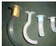
Figure 10.2: Oropharyngeal airway.