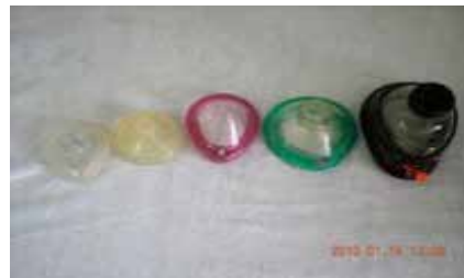
Figure 10.1: Various sizes of paediatric masks.

The Ayre's T-piece breathing circuit (Figure 10.3) is used for children weighing less than 20 kg because it is a low-resistance circuit. For children weighing more than 20 kg, an adult circuit (Bain or Magill) can be used. The Ayre's T-piece can be used for both spontaneous and assisted ventilation.