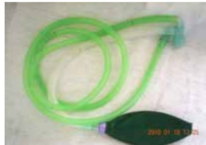
Figure 10.3: An Ayre's T-piece.