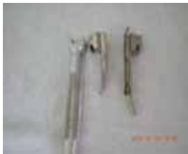
Figure 10.4: Miller's blades and handle.

Due to the neonate's relatively large head, a small roll should be positioned under the shoulders to prevent hyperflexion of the head and align the axis of the mouth, pharynx, and larynx to allow for easy flow of air. For the older child, no pillow or roll is needed. An appropriately sized oropharyngeal airway can improve mask ventilation.