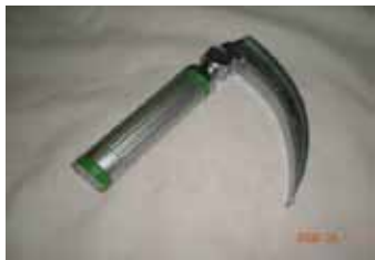
Figure 10.5: Macintosh blade and handle.